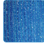
Filter with Microban® protection